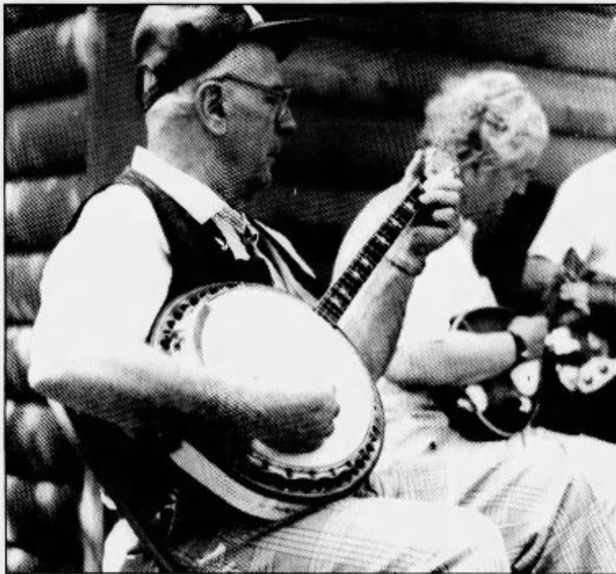
Oldtime music for oldtimer gathering