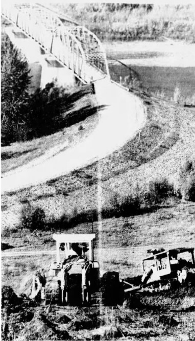
Bulldozers at work above the bluff on eastern slopes of Grande Prairie Ski Club's hill overlooking the Wapiti River.