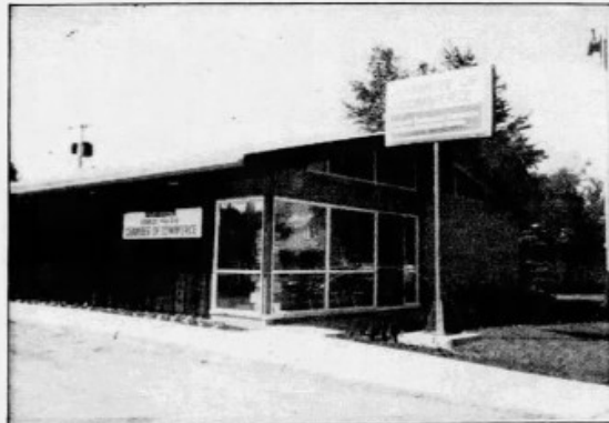
Tourist and Convention Information is available at the Chamber of Commerce Office 10011-103 Avenue.

The Alberta Chamber, through the passage of many important resolutions during the plenary sessions at the Annual Meeting, is well positioned to speak on behalf of the business community on many important matters. A copy of the approved Resolutions can be viewed at the Chamber office.