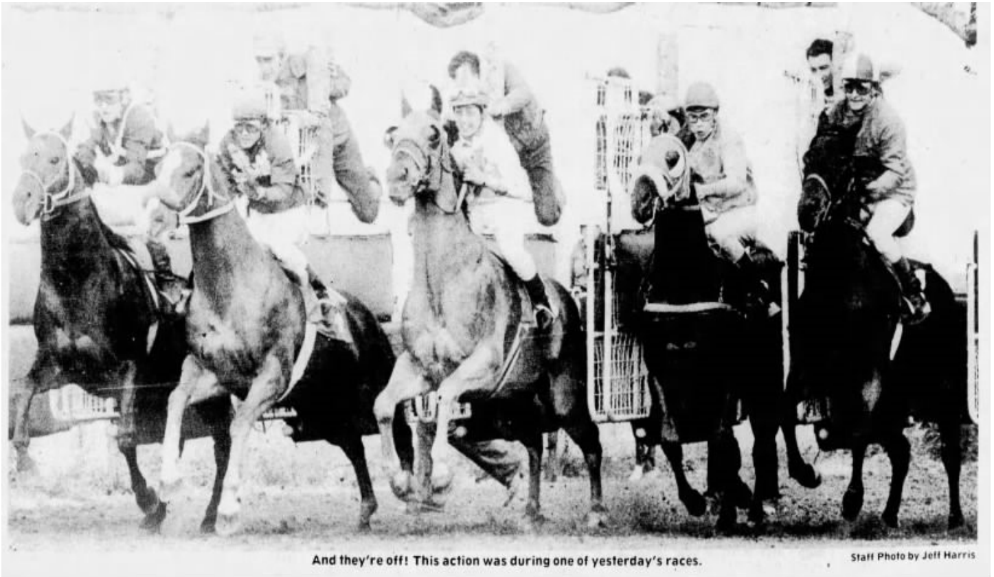
And they're off! This action was during one of yesterday's races.