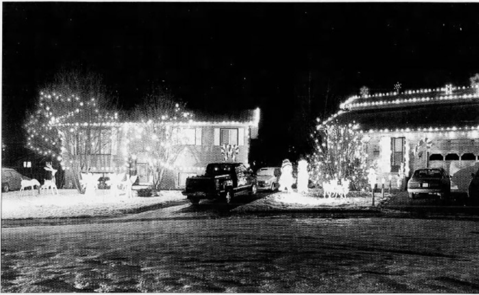
Candy Cane lane is a Christmas tradition in Grande Prairie. Residents routinely flock to South Patterson to sneak a peek at the decorations.

That's what makes it all the worthwhile, say the couple. The cost of lighting up for a month is no bother.