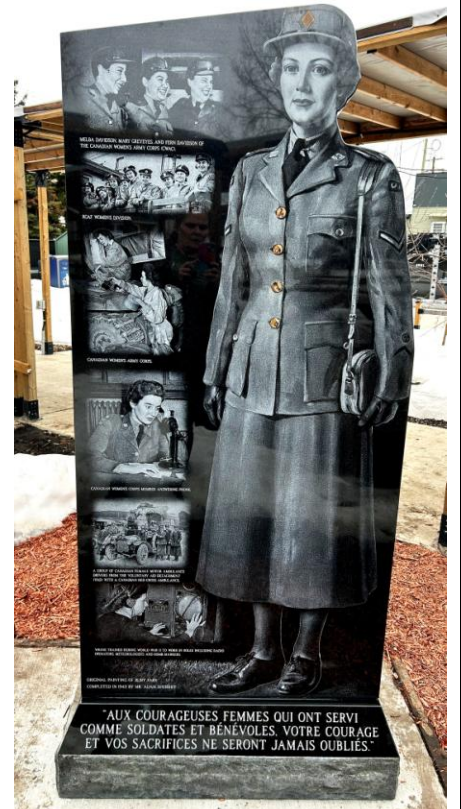
Women of War Monument

During the First and Second World Wars, many women felt they had an opportunity to enlist and assist their country in any way that was required. Their changing roles during these tumultuous years made way for great changes in the way society looked at women. Their service and sacrifice during the First World War helped influence the decision to grant federal voting rights to many Canadian women in 1917. The efforts of these pioneering women helped open the door for 50,000 women who now serve in a broad array of roles in the Canadian Forces.