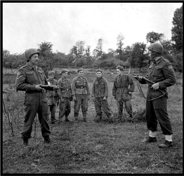
Soldiers of the German 12 th Panzer Division in a temporary prisoner of war cage in Normandy. Two Canadian Provost Corps soldiers stand guard, July 7-8, 1944.

The 3rd Canadian Infantry Division and the 2nd Canadian Armoured Brigade landed on Juno Beach on D-Day, June 6th .