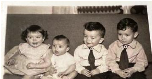
Four oldest Withers' children