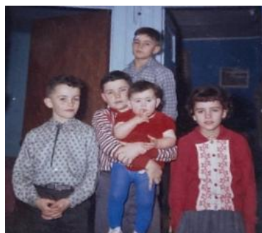
All five kids